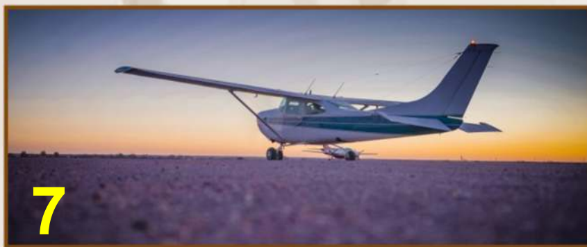
IT'S ALWAYS DARKER ON THE GROUND