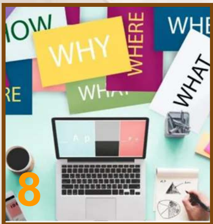
5 WHYS—ROOT CAUSE ANALYSIS