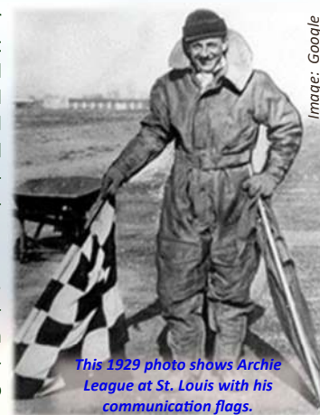
This 1929 photo shows Archie League at St. Louis with his communication flags.

Wishing all Air Traffic Controllers here in Fiji and around the world a happy International Day of the Air Traffic Controller.