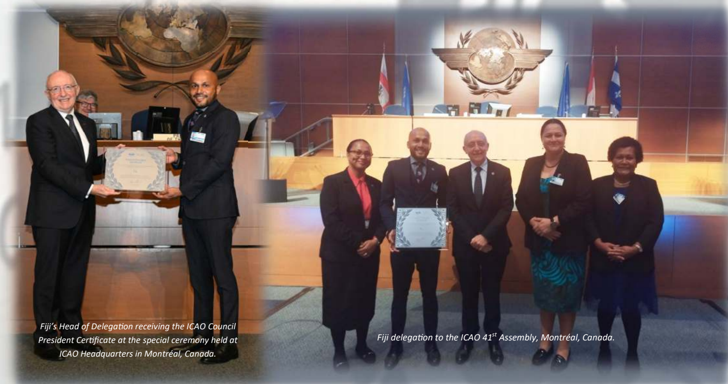
Fiji's Head of Delegation receiving the ICAO Council President Certificate at the special ceremony held at ICAO Headquarters in Montréal, Canada.