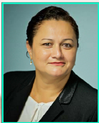
From the Acting Chief Executive

B ula Vinaka and welcome to the Civil Aviation Authority of Fiji's (CAAF) third edition of its Aviation Safety Bulletin for 2022.